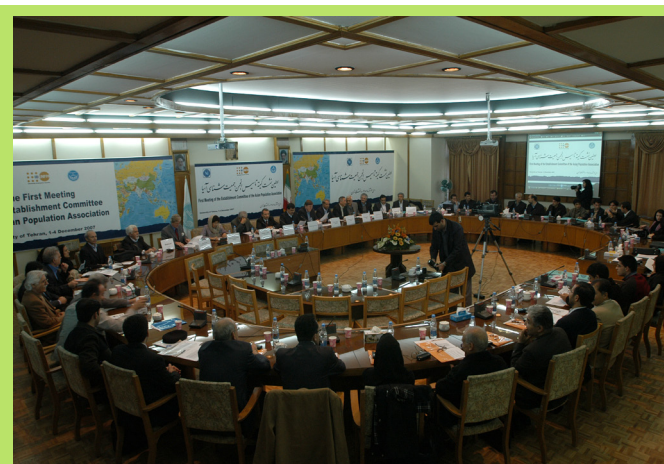
Inauguration of the Establishment Committee of the APA, University of Tehran, December 2007

The association was later registered in Bangkok and the Secretariat set up at the College of Population Studies of Chulalongkorn University. A nominations committee was also constituted to identify distinguished scholars from the region to contest the first election of APA for various council positions. During September-October 2008, APA successfully conducted an online election in which nearly 66 percent of the 578 eligible registered members participated. Both the process and outcome of the election have resulted in having scholars with creditable academic records on APA's council. The new council met in Bangkok in February 2009 and planned the future activities of the APA. More information can be found from the APA website: http://www.apa.cps.chula.ac.th .