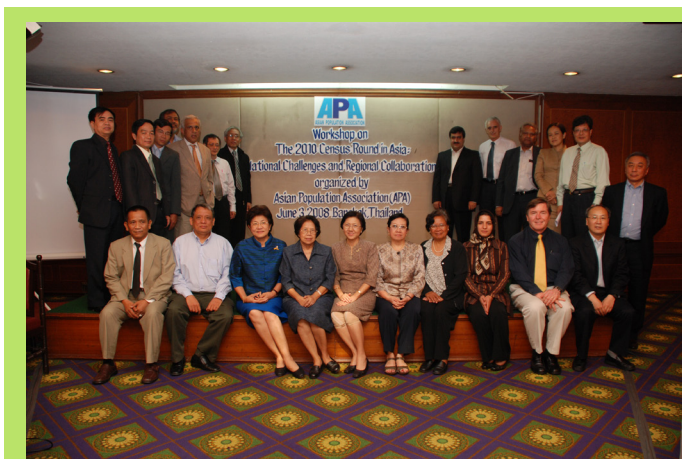
Participants of the second APA workshop, June 2008, Bangkok

The first APA workshop on the Emerging Population Issues in Asia was held at the Department of Demography, Faculty of Social Sciences, University of Tehran on 3 December 2007. Members of the Establishment Committee presented papers on various population issues in the region.