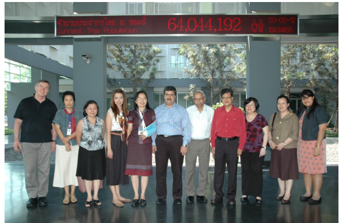
APA Council Members Meeting, 19-20 February 2012 Mahidol University, Thailand

The Council also discussed the amendment of the APA constitution that will be included in the Newsletter for the information of the members, and shall be discussed at the next AGM at the time of the conference. On 19 February, the Council also visited the Swissotel Le Concorde, Bangkok, the Venue of the APA conference, and held a Fundraising and Networking Dinner with several colleagues from Mahidol and Chulalongkorn universities.