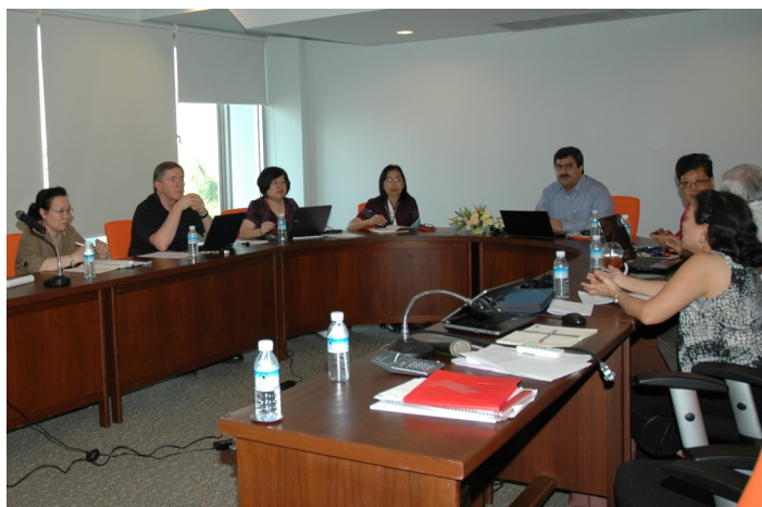
Second APA Council Members Meeting, 19-20 February 2012 Mahidol University, Thailand

If approved, the amendments on the term of office would be applicable to the Councils to be elected in the future and not to the present Council.