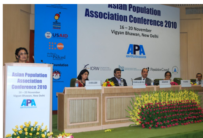
First APA Conference, 16-20 November 2010 New Delhi, India

The conference drew nearly 400 participants from 29 countries – mostly Asian but a few research scholars working on Asia but living in countries like the US, UK, Germany, Netherlands, also attended the conference. In all, 14 themes were identified and internationally renowned experts were requested to select abstracts pertinent to each of the themes and create sessions and identify chairs and discussants for the sessions. The APA had received, in response to a call for submission of abstracts, nearly 700 abstracts. Based on this, 230 papers were presented in 58 sessions. Also, nearly 150 posters were presented over three days. The presence of many young demographers from across Asia who experienced the stimulating environment and high quality of the conference was noticeable.