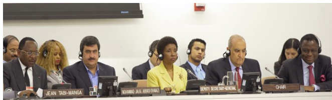
The 2011 Population Award winners with UN Deputy Secretary-General, Egypt's Ambassador to the UN and UNFPA's Executive Director.