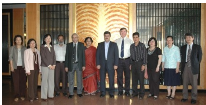
APA Council Members 2011-2012